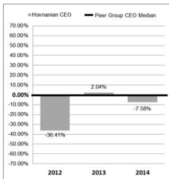
Hovnanian CEO Total Direct Compensation vs. Peer Group CEO Median Total Direct Compensation (1)(2)